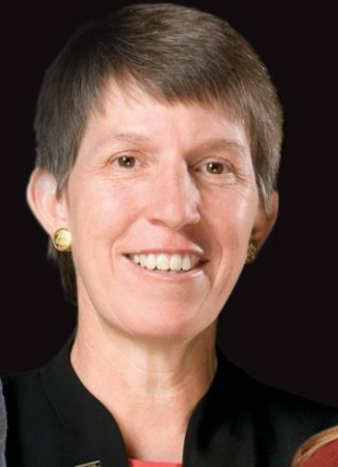
BECKY HALSTEAD RETIRED U.S. ARMY BRIGADIER GENERAL