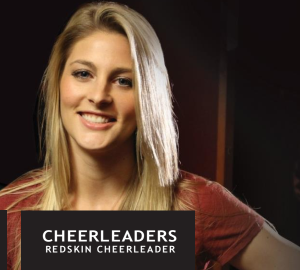
CHEERLEADERS REDSKIN CHEERLEADER