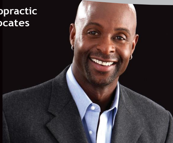
JERRY RICE HALL OF FAMER